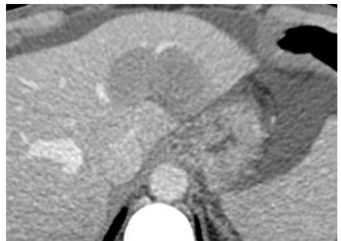
Figure 1. Contrast-enhanced axial CT scan demonstrating the large hepatic metastases (6.0 × 4.8 cm) located in the left hepatic lobe and close to the left suprahepatic vein prior to ECT procedure. CT indicates computed tomography; ECT indicates electrochemotherapy.

The largest of the hepatic lesions was located in the left hepatic lobe and close to the left suprahepatic vein. The tumor size was 6.0 × 4.8 cm in axial section at the abdominal CT scan (Figure 1).