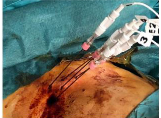
Figure 2. Percutaneous placement of five electrode needles for hepatic lesion treatment.

tumor location or the presence of medical co-morbidities. In some highly selective scenarios resection appears to remain superior in terms of disease recurrence rates and overall and disease-free survival. For curative intentions in term of local tumor control there are reports of equivalent results following local-regional ablation treatments when compared to resection in selected patients [36–38].