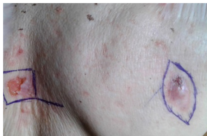
Figure 2. Old scars and new tumor lesions

Overall survival after a median follow-up of 8 months was 70.0%. At 24 months, overall survival was 29.0% ( Figure 3 ). This survival was correlated with being operated upon (88.2% versus 46.2%) ( p = 0.02 ). It varied according to the stage: 87.5% for the localized stage, 53.8% for the locally advanced stage and none for the metastatic stage ( p = 0.056 ). None of the factors were independent after analysis by the Cox model.