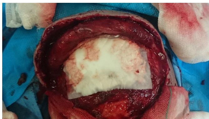
Figure 1. Collagen tissue dura sheets application

Underlying dural defects in traumatic bifrontal craniotomy, without the need for suture collagen tissue dura sheet is embedded with the cover margin of at least 1cm from surrounding healthy Dura on the defect site.